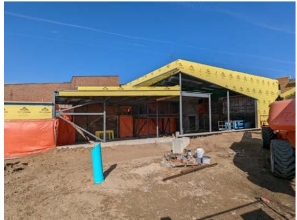
Exterior: View towards the north (South Entry from Hardy Ave.)

As work continues into March, further progress with the exterior wall construction and interior areas of the accessible change room and main lobby should be observed.