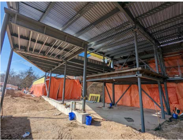
Interior: View towards the main entry and lobby area