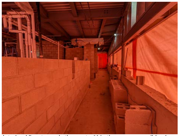
Interior: View towards the east within the new accessible change room area