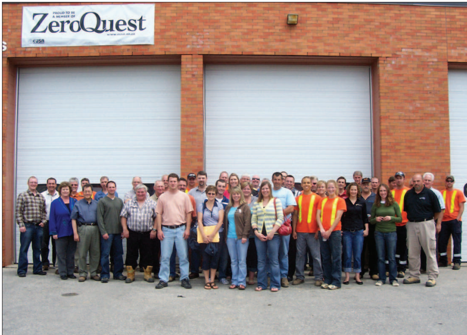
The Town of Tillsonburg celebrated its achievement at its annual Health & Safety BBQ

ZeroQuest is comprised of four levels, which include; Commitment, Effort, Outcomes, and Sustainability. Each level builds upon the previous one. The goal of ZeroQuest is to guide participants through